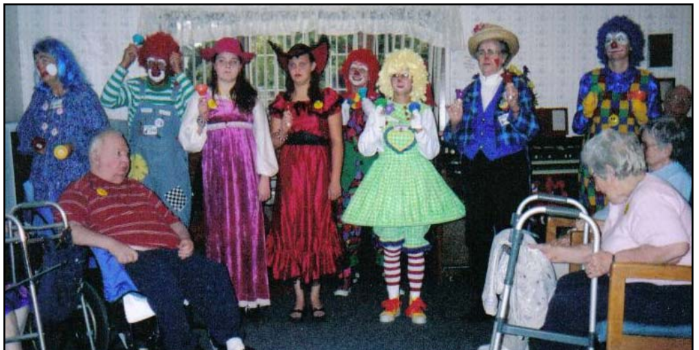
Kingsville Community of Christ Kid's Klub and Mid-MO Clowns sharing together at the Holden Manor.